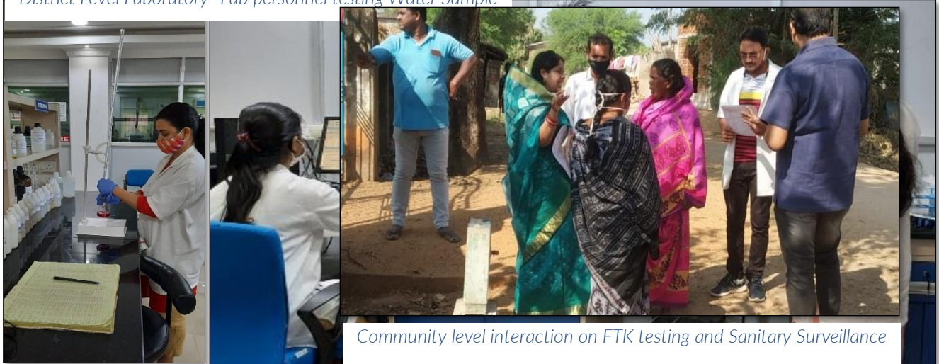
Community level interaction on FTK testing and Sanitary Surveillance