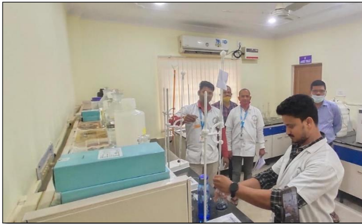
District Level Laboratory- Lab personnel testing Water Sample