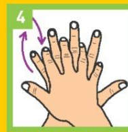
4 PALM TO BACK OF HANDS