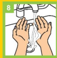
8 RINSE HANDS