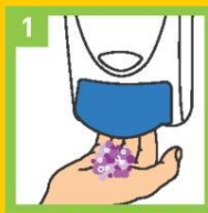
1 APPLY SOAP