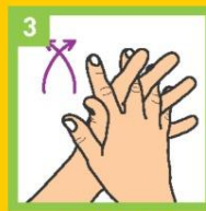
3 FINGERS INTERLOCKED