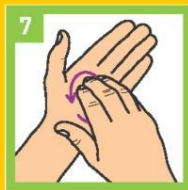
7 FINGERS INTO PALMS