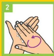
2 RUB HAND PALM TO PALM