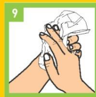
9 DRY HANDS THOROUGHLY