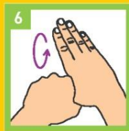
6 THUMBS CLASPED IN PALM